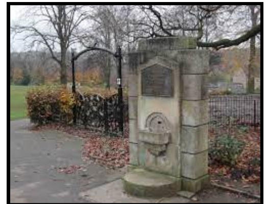
Carr Bank Park

Carr Bank Park —If your child uses this local area of natural beauty as a route to/from the academy, can you please remind them that members of the public also use the park and that they represent our academy when wearing our uniform? We expect every child to conduct themselves with respect on these journeys.