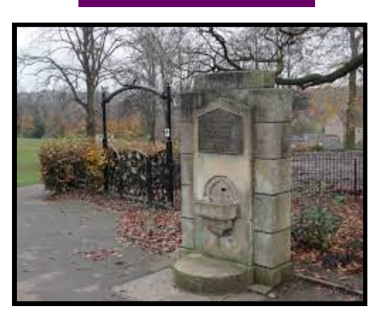
Carr Bank Park

to/from the academy, can you please remind them that members of the public also use the park and that they represent our academy when wearing our uniform? We expect every child to conduct themselves with respect on these journeys.